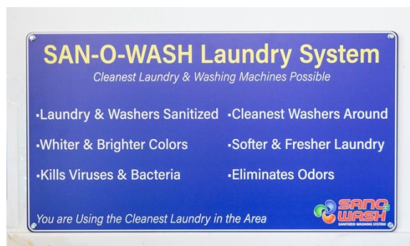
Laundry Magic in Torrington explains its San-O-Wash system.